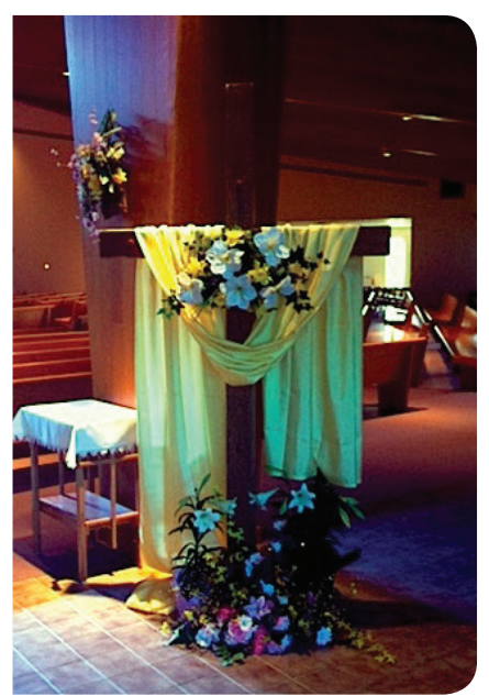
Our Mission and Our Prayer